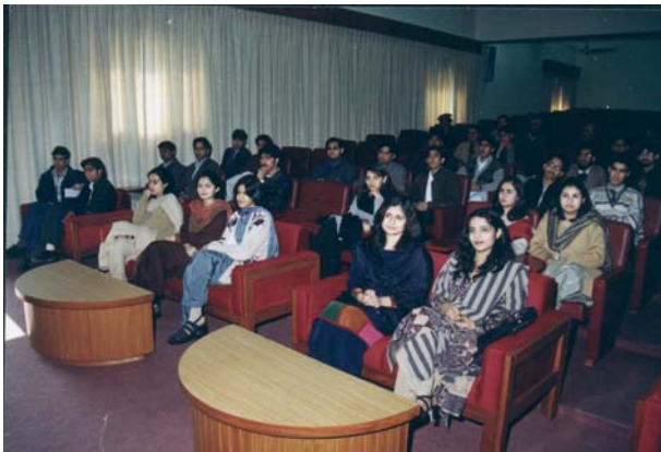
1 st Get Together of NPTC Alumni Association, PIEAS, August, 2000