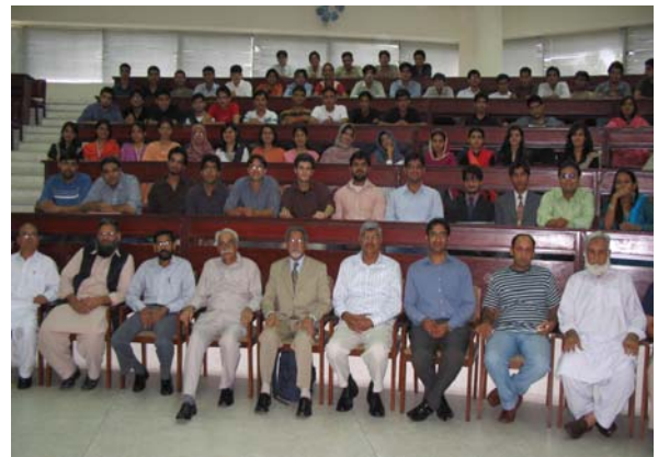
8 th Annual NSTC Alumni Association Get Together, GIK-I, 4 th August, 2007