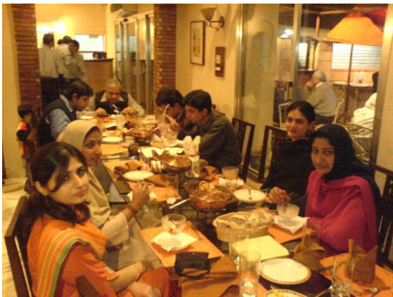
NSTC Alumni at a Dinner in Islamabad