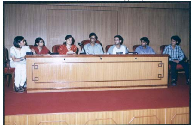
Office Bearers of NPTC Alumni at the 2 nd Annual Get Together of NPTC Alumni Association, PIEAS August, 2001