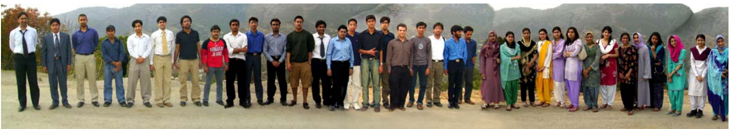
NSTC Alumni at Pir Sohawa, 29 th March, 2007