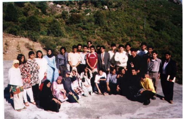
NSTC Alumni at Pir Sohawa, near Islamabad, 29 th March, 2006