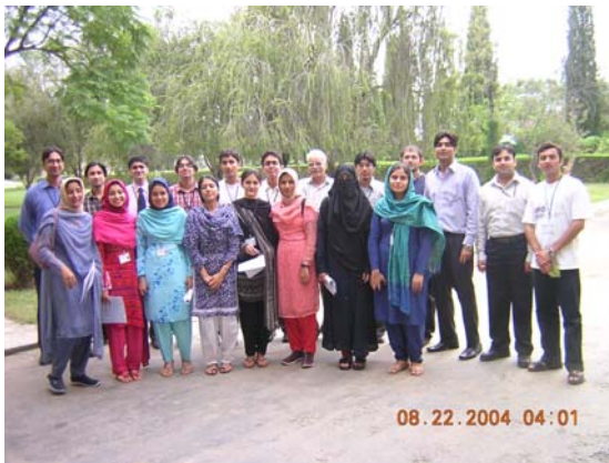
5 th Annual Get Together of NPTC Alumni Association, PIEAS, August, 2004